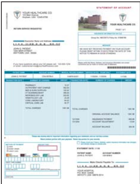
Multi-color custom statement

With Emdeon ExpressBill Services, undeliverable mail is reduced by utilizing Emdeon Address Cleansing Services featuring USPS® NCOALink® technology. Emdeon ExpressBill Services also provides efficient processing, printing and mailing of clear, concise financial statements including postal pre-sorting and USPS® delivery.